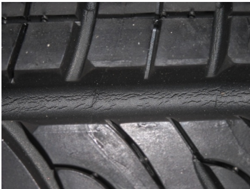
Cracking in tread groove