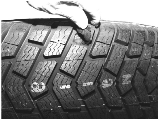
Tread element tear