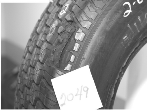
Belt edge separation