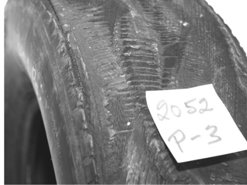
Loss of tread and belt