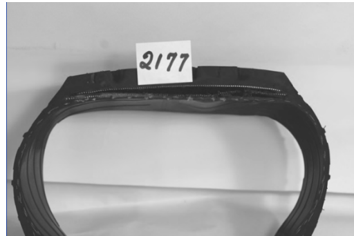
Separation between belts