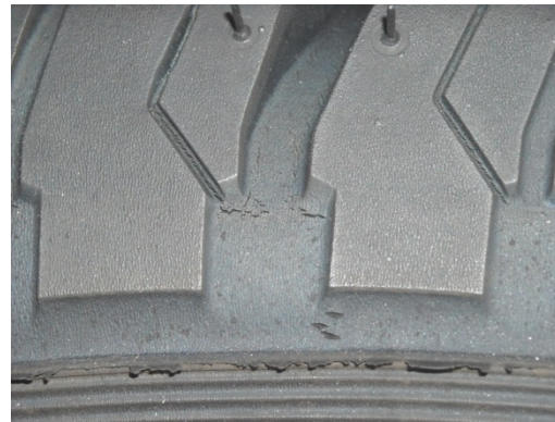
Cracking at base of tread shoulder