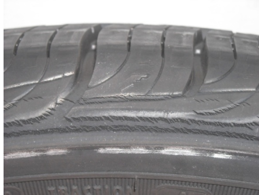
Cracking in shoulder