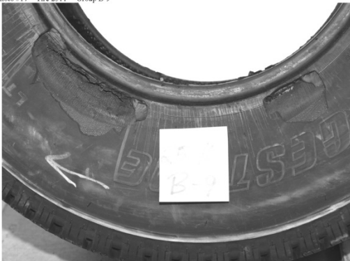
Black sidewall separation