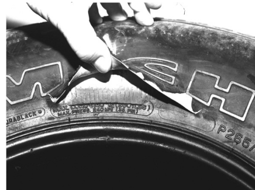
White sidewall separation