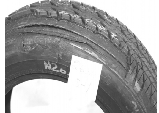
Tread and belt separation