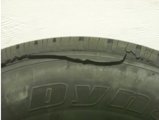
Tread separation at shoulder