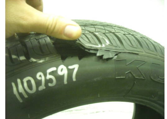
Tread shoulder cracking out of oven